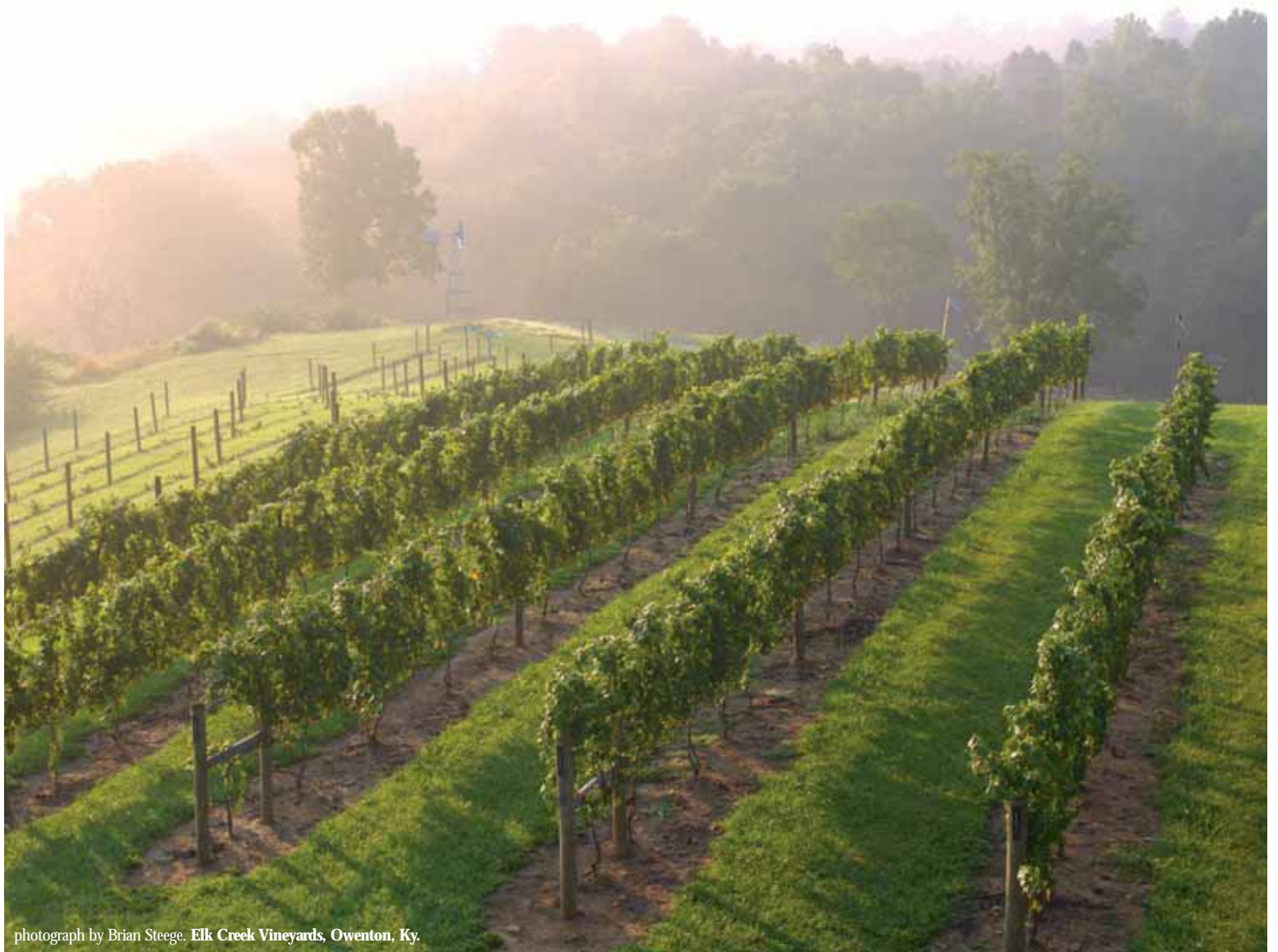
Elk Creek Vineyards, Owenton, Ky.